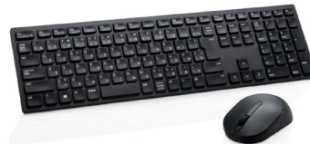
Dell Pro Wireless Keyboard and Mouse - KM5221W

Designed for on-the-go productivity and protection, the Dell EcoLoop Pro Briefcase is made of eco-conscious material to complement any lifestyle.